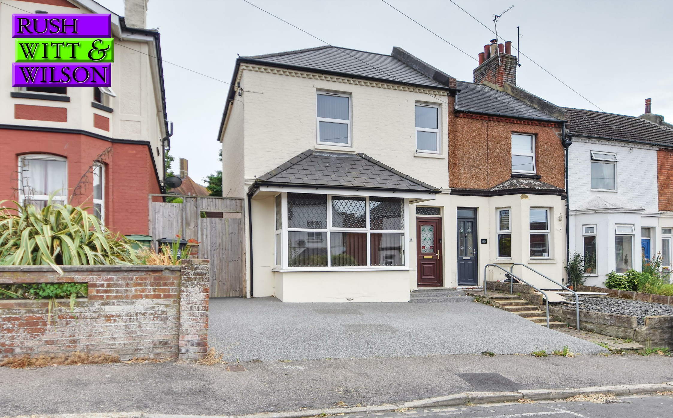
19 Springfield Road, Bexhill-On-Sea, East Sussex TN40 2BX £339,950